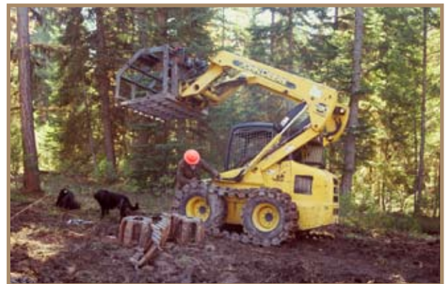
Equipment adjustments were made during an afternoon break in Hungry Horse to West Glacier Fuels Reductions activities on Flathead National Forest lands immediately adjacent to a number of homes in the wildland-urban interface.

Until more experience is acquired in using best value, the “best and final offers” submitted by offerors may be better thought out following discussions with the Contracting Officer than they would without the discussions.