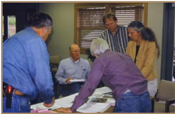
Members of the Flathead Forestry Project and Forest Service officials review the details of the Paint Emery Stewardship Project, designed to test the potential environmental and economic benefits of “delivered log” contracting.

It is important to utilize the collaborative process in defining best value criteria. Collaborative groups and other stakeholders have a good understanding of the needs and opportunities for maintaining or restoring both ecological well-being and community economies. They can provide valuable input into the formulation of the technical proposal requirements and proposal evaluation ranking and weighting factors. Together with agency personnel, they can consider the resources available and help craft an appropriate set of bundled activities to be incorporated into the stewardship contract.