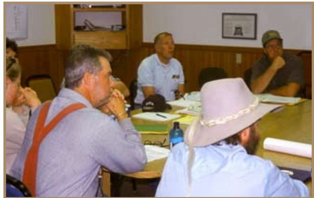
Potential offerors on the Hungry Horse to West Glacier Fuels Reduction stewardship project discuss the project at the District Ranger's office before going into the field with agency personnel and members of the local collaborative group for a “show-me” tour.

(2) National Fire Plan: Evaluation for award should include commitment of the contractor to training and/or hiring rural community residents. Contractor shall provide their proposed plan for training and hiring rural residents