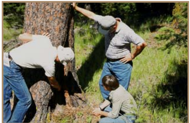
Members of the Inland Northwest Regional Multiparty Monitoring Team discussed stand conditions and previous disturbances on the site of the Littlehorn Wild Sheep Habitat Restoration stewardship project on the Colville National Forest.