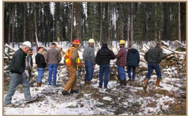
The multi-party monitoring team for the Clearwater Stewardship Project made frequent site visits to observe restoration activities and discuss progress with the contractor and Forest Service personnel. Winter logging both ensured grizzly bear security and minimized site disturbance.

The second paragraph provided a way for new contracting entities to use the previously demonstrated capabilities of their principals and/or employees to meet this requirement. This was important not only to new businesses, but also to non-traditional contractors hoping to take their first step into on-the-ground forest restoration work. Lakeface Lamb , for instance, was successfully competed for by the Priest River Development Corporation, a not-for-profit organization. PRDC was new to Forest Service contracting, but had tapped a very experienced individual to be their stewardship project manager.