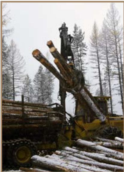
Logs removed by the service contractor doing this campground improvement project on the Paint Emery Stewardship Project were delivered to the mill which had purchased them “on the stump.”

The trade-offs considered and how and why the final decision is made must be carefully documented by the contracting officer.