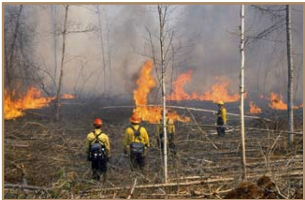
Both broadcast and “jackpot” burning were used as part of the Cedar Flats project's goal of restoring fire to the ecosystem.

The Whiskey South solicitation, for instance, gave “incentives” (the BLM term for rewarding the contractor for greater success) for “ utilization of biomass, post/poles, other minor forest products especially in support of the local community. . . ”